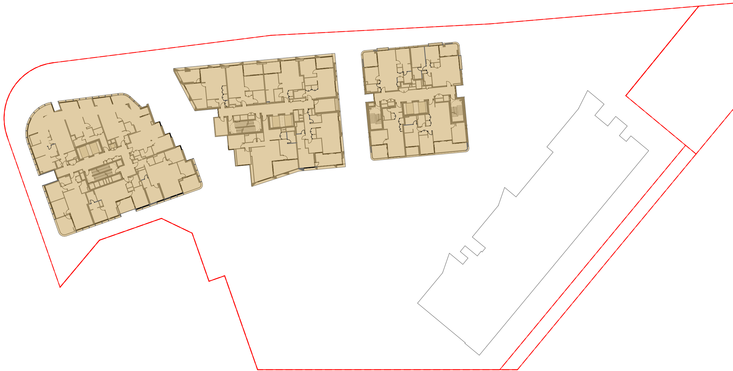
3 Level 10_APT 1:500