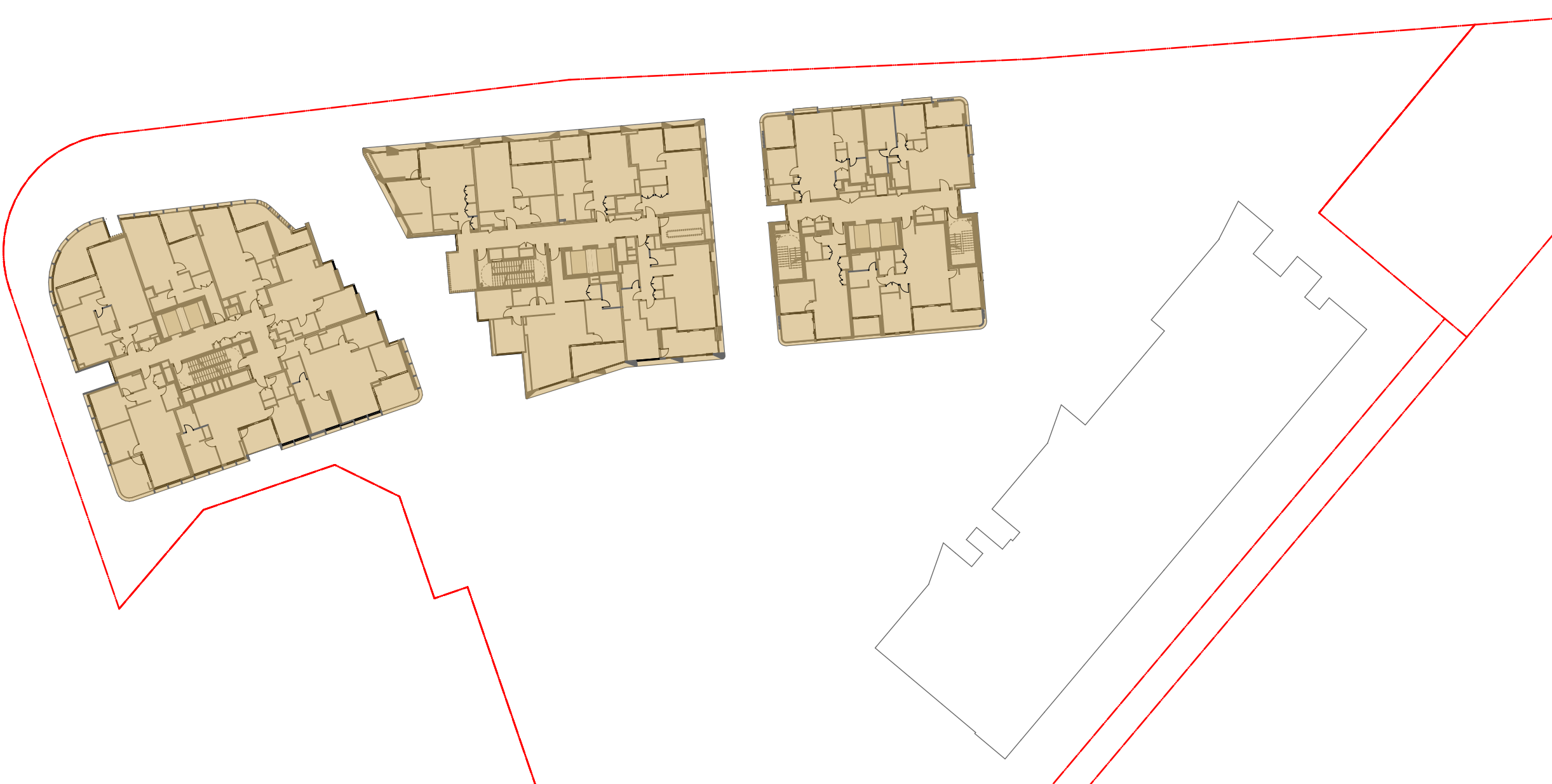
2 Level 09_APT 1:500